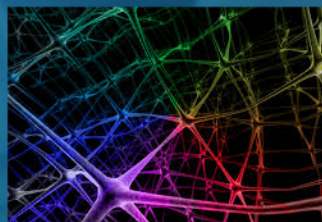
"Re-building the K-12 Operating System" Transforming Teaching, Harvard Graduate School of Education, September 2011