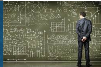
How Will Educators Deal With the "Death of Expertise" ?