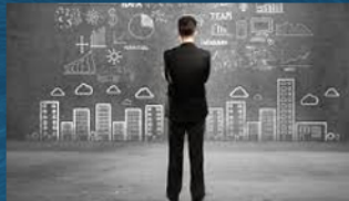
Rise of an Architect-leader in Schools