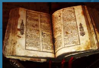
Textbooks Will Soon Be On the History Shelf