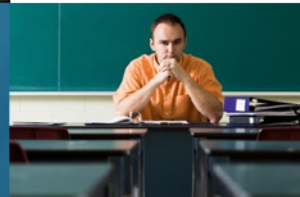
"Getting Comfortable With Discomfort" Edutopia, July 2015